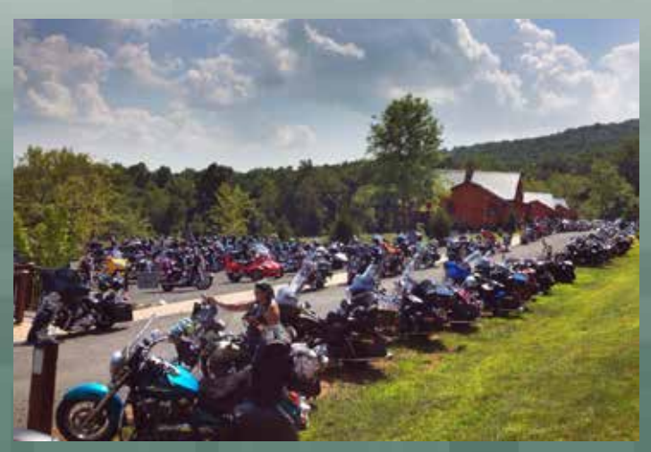
Our Healing Heroes Ride is an annual motorcycle poker run that turned out more than 500 riders and guests for an afternoon of high stakes poker, great food and fun! Patriot Harley Davidson and the Berryville VFW Post 9760, hosted our starting locations and the Retreat was the final destination!