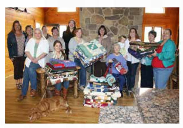
Beautiful handmade quilts adorn the beds in the Retreat's four cabins. Lap quilts are a signature gift in our guest family welcome baskets. This expert handy-work is the result of ongoing support from Joshua's Hands, the Waterford Quilters Guild and other dedicated organizations and individuals.