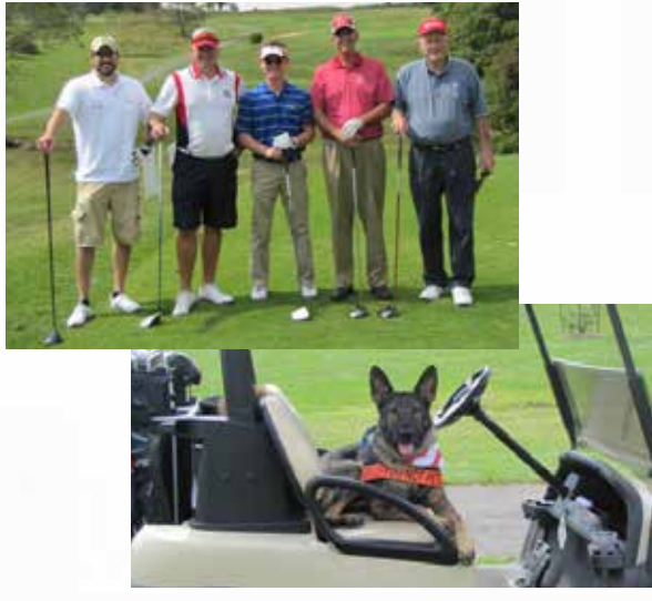
Golf tournaments are a regular feature of the Retreat's fundraising events calendar each year and always a terrific opportunity for corporate and individual participation. The leadership and staff of Veterans Management Services, Inc. and CGRT, Inc. organize and serve as presenting co-sponsors for the Retreat's successful annual tournament.